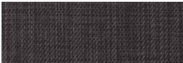
Solar Heat & Light Control Properties