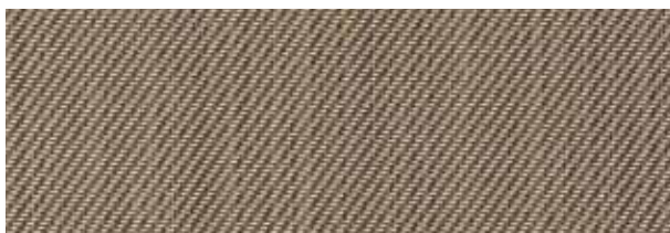
Solar Heat & Light Control Properties