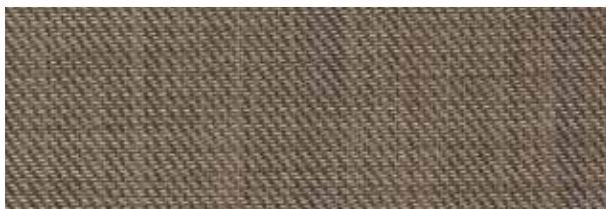
Solar Heat & Light Control Properties