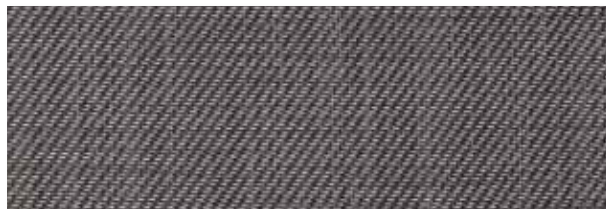
Solar Heat & Light Control Properties