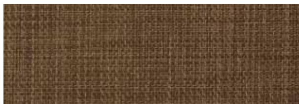
Solar Heat & Light Control Properties