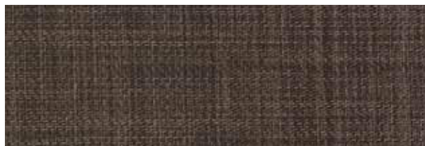
Solar Heat & Light Control Properties